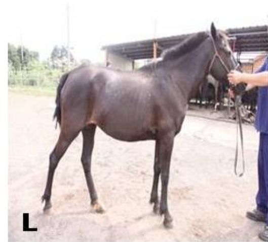
Figure 2.4. Mare horse of Laboratory animal(after experimental group). G : 일만이 H : 명문족 I : 바람이 J : 태풍 K : 안성맞춤 L : 진한감동