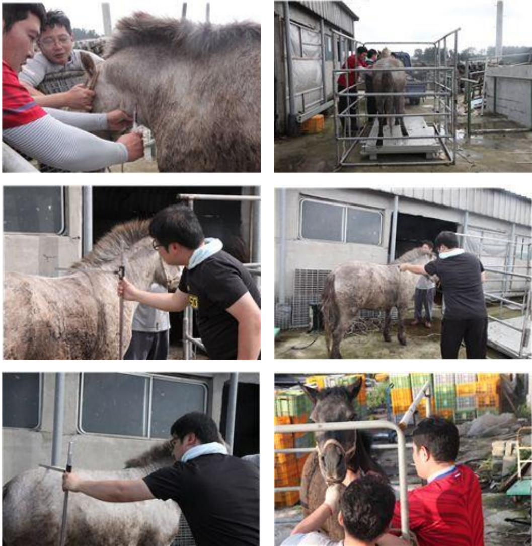
Figure 1.2. Collected experiment sample pictures of fattening horse.