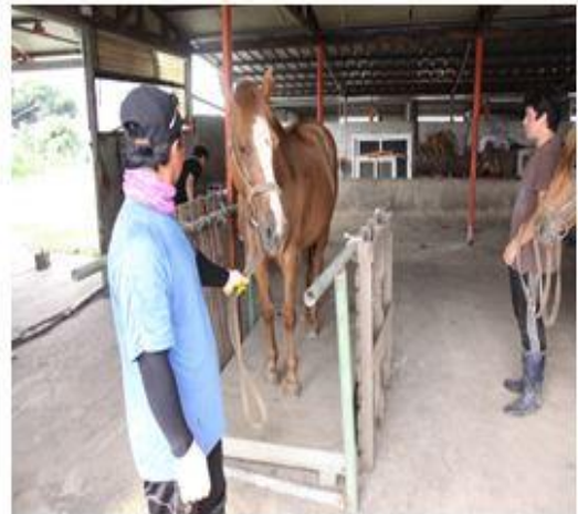
Figure 2.10. Collected experiment sample pictures of horse.