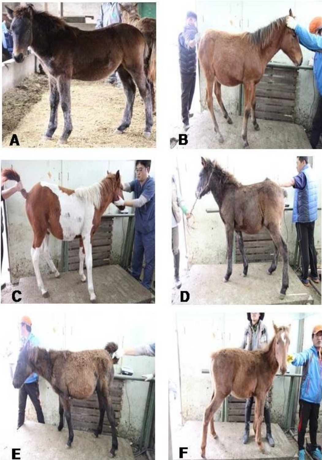
Figure 2.6. Growing horse of Laboratory animal(after control group).