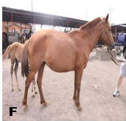
Figure 2.2. Mare horse of Laboratory animal(after control group).

A : 여왕님 B : 속전속결 C : 용의눈물 D : 왕공주 E : 똑똑이 F : 주력호