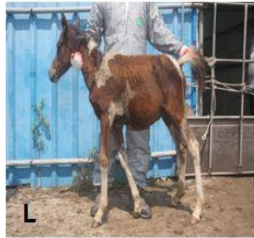
Figure 2.7. Growing horse of Laboratory animal(before experimental group).