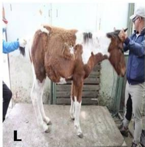
Figure 2.8. Growing horse of Laboratory animal(after experimental group).