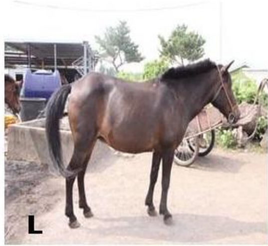
Figure 2.3. Mare horse of Laboratory animal(before experimental group).

G : 일만이 H : 명문죽 I : 바람이 J : 태풍 K : 안성맞춤 L : 진한감동