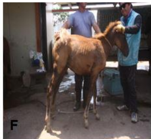
Figure 2.5. Growing horse of Laboratory animal(before control group).