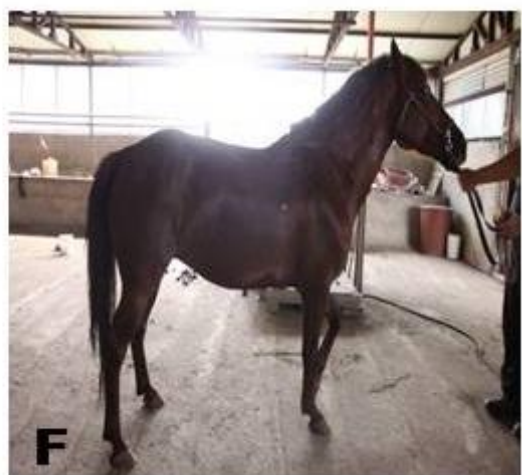
Figure 2.1. Mare horse of Laboratory animal(before control group).

A : 여왕님 B : 속전속결 C : 용의눈물 D : 왕공주 E : 똑똑이 F : 주력호