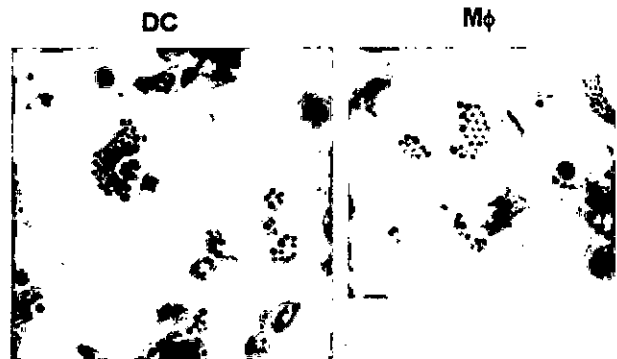
Figure 1. E. muris -infected cells (5 days postinfection) were stained by Diff-Quick staining. Magnification: 1,000× DC: dendritic cell, MΦ, macrophage.

In order to find the major cell type for E. muris infection, we generated bone marrow-derived DCs and macrophages from C57BL/6 mice and challenged them with E. muris in vitro. E. muris infection caused generation of bacteria-containing vacuoles (morulae) in both DCs and macrophages as observed by Diff-Quick staining (Fig. 1). Diff-Quick staining showed that there was massive multiplication of E. muris and almost all of the cells were infected with E. muris . Furthermore, E. muris proliferated